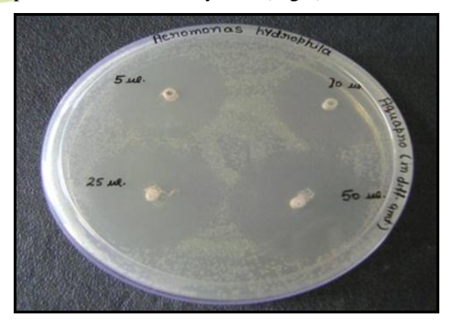
Figure 1: Anti-microbial activity of photoactivated cow urine against Aeromonas hydrophila measured by agar disc diffusion method, expressed as the diameter of the zone in mm

The bactericidal activity of the present study is also constituent with the reports of other authors which also show potent antibacterial activity in fresh urine. The activities of photoactivated urine were comparable with that of standard or positive control tetracycline (Fig.1).