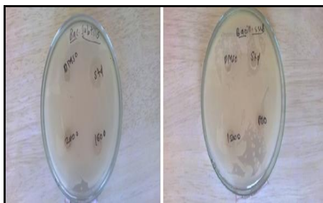
Figure 1: Zone of Inhibition for Bacillus Subtilis