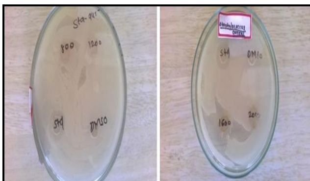
Figure 2: Zone of Inhibition for Staphylococcus Aureus