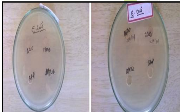
Figure 3: Zone of Inhibition for E. Coli